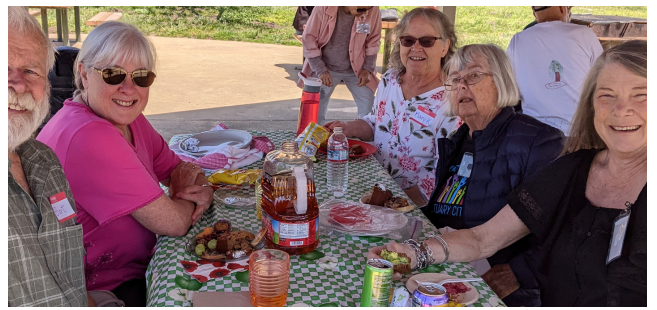
Good food and friends