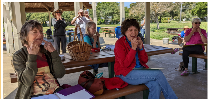
While we warm up our mouths