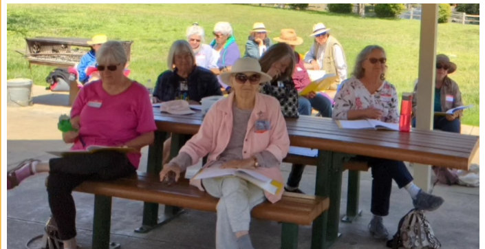
And review the lyrics of songs we used to know by heart